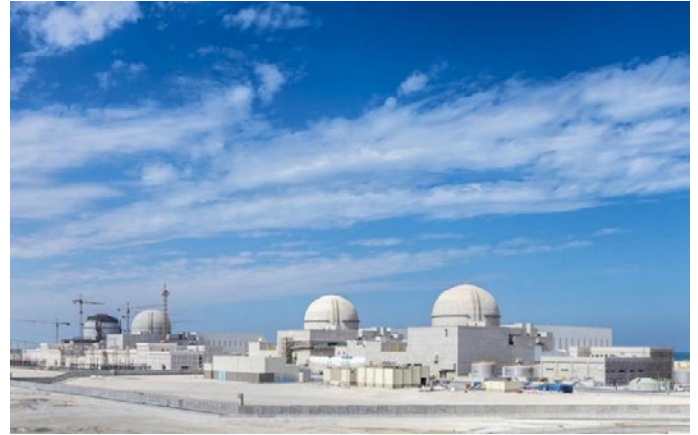
Barakah Nuclear Energy Plant

technology solutions, and also an eco-friendly residential development equipped with retail, restaurants, and public spaces. It houses the Masdar Institute of Science and Technology, the Emirates College of Technology, the Siemens Middle East Headquarters, and the International Renewable Energy Agency (IRENA) Headquarters, to name a few. Not only is Masdar City a massive experiment in how cities can be designed and built more sustainably, but it is also a functioning centre for clean tech development.