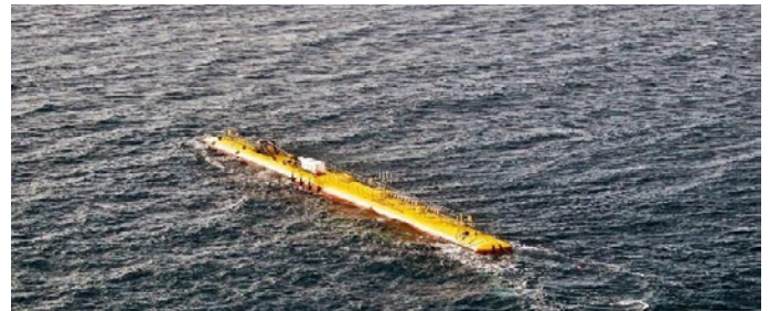
Scotrenewables Tidal Power SR2-2000 Floating Turbine

Currently there are five tidal energy developers located at the FORCE facility: Atlantis Operations Canada Ltd. (AOCL); Cape Sharp Tidal, Black Rock Tidal Power, Minas Tidal—IME—Tocado, and Halagonia Tidal Energy Ltd.