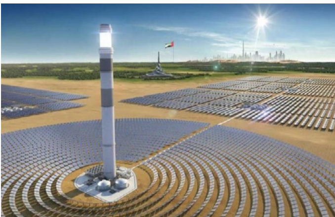
Mohammed bin Rashid Al Maktoum Solar Park

The project is being managed and implemented by the Dubai Electricity and Water Authority. Overall the total investment for the Solar Park is expected to be US$13.0 billion.