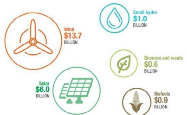
INVESTMENT IN RENEWABLE ENERGY BY TECHNOLOGY IN CANADA FROM 2013 TO 2017

Canada has now set its sights on increasing both wind and solar power capacity, with the two energy sources seeing the highest levels of renewable energy investment (public and private) in the country between 2013 and 2017. Another area of growing interest in renewables is tidal energy. Canada's Atlantic coast is home to the world's highest tides, creating significant potential to test and generate energy from the ocean.